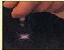
SPECIAL EFFECTS STARBURST TECHNIQUES