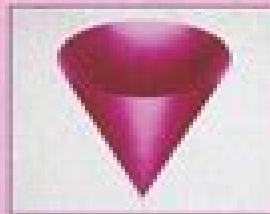
MASKING BASIC SHAPES