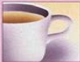
GRADATED TONES AND COLORS