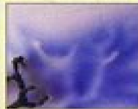
ROUND OBJECT MASKING