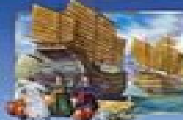
TRAVELERS AND EXPLORERS