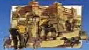
STORY OF THE PAST