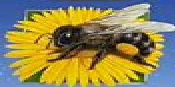
INSECTS AND SPIDERS