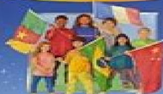
CHILDREN OF THE WORLD