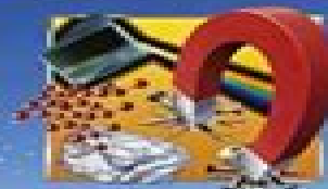
SCIENCE ALL AROUND US