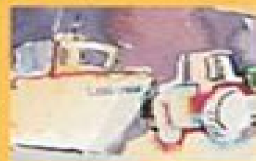
LINE AND WASH