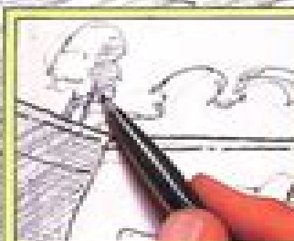
HATCHING • FELT PEN