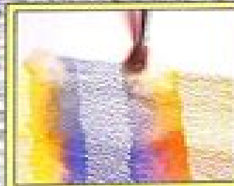
BLENDING • WATER SOLUBLE PENCILS