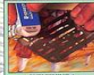
BURNISHING • COLOURED PENCILS