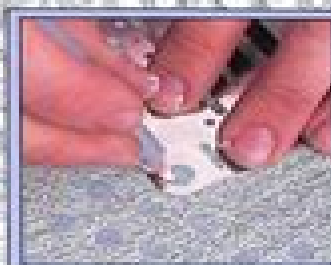
STENCILLING • COLOURED PENCIL