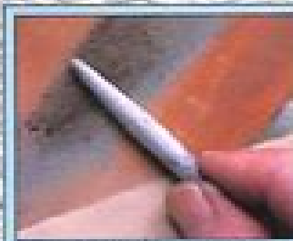
TORCHON BLENDING • PASTEL