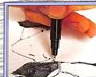
CROSSHATCHING • RAPIDOGRAPH