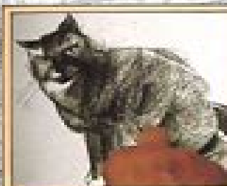
BROAD STROKES • CHARCOAL