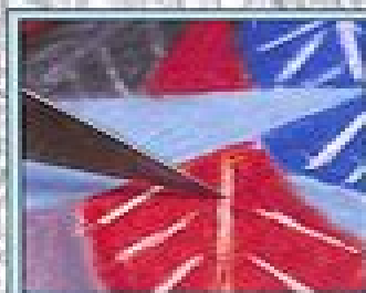
SGRAFFITO • PASTEL