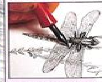
LINEAR MARKS • PEN & INK