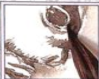
BRUSH DRAWING • INK