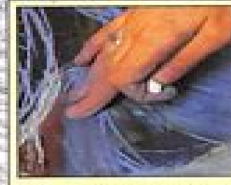
FINGER BLENDING • PASTEL