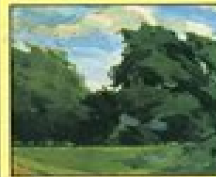
WET ON DRY