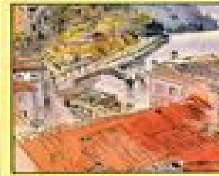
LINE AND WASH