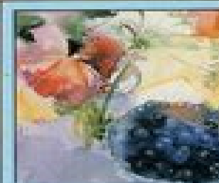
HARD AND SOFT EDGES