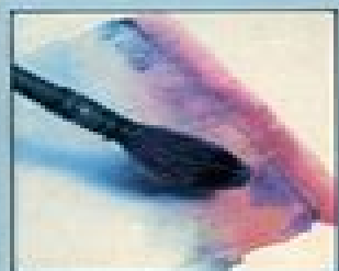
WET IN WET