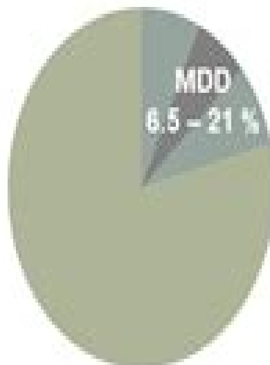
Mean lifetime prevalence of major depressive episode 4

The lifetime prevalence of MDD is 6.5–21%, depending on the country 2-4