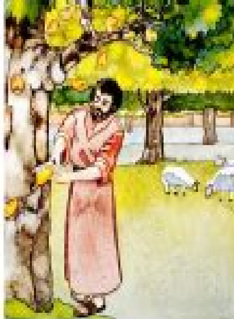
Amos 760 BCE