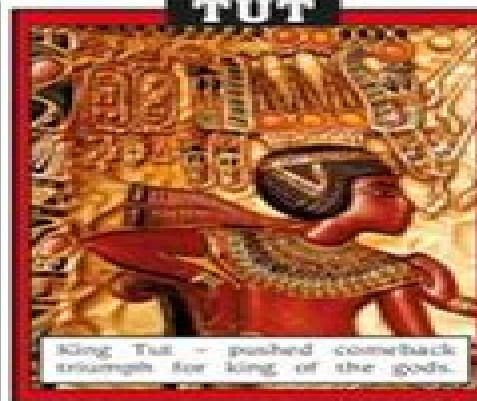
King Tut - pushed comeback triumph for king of the gods.

Tut Tut, 9, announced the togethery turn-around after high-level discussions with palace advisors. "Amun is now top god again, and his shrines and statues will be making a