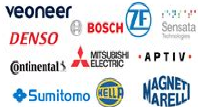
Notable Emerging Companies in Automotive ECU Market