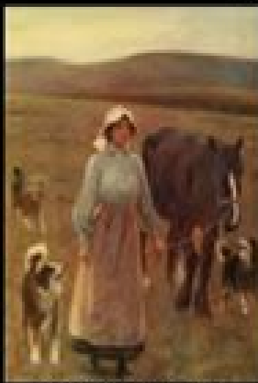
RHODA FROM THE VIRGIN IN JUDGEMENT