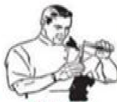
Applying Theory B