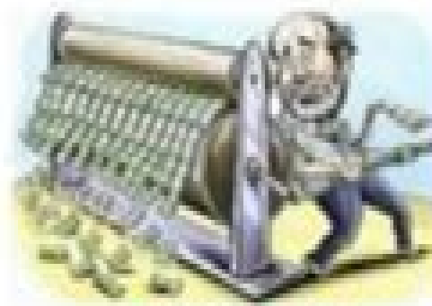
Applying Theory C