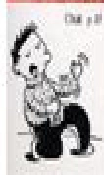
Chalk p. 15