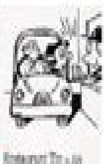
I Read It p. 10