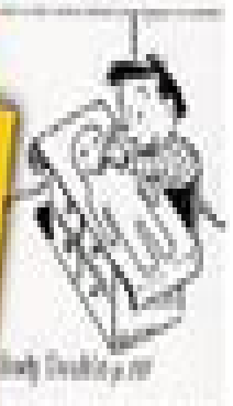
Study Smack p. 13