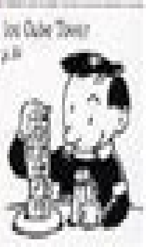
Ice Cube Tower p. 17