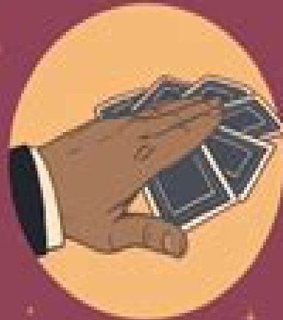
The Magnetic Hand