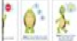
Step 3: Tuck inside your shell and take those deep breaths

Thank you for your support of the Tucker Turtle Kit.