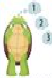
Step 3: Tuck inside your shell and take those deep breaths