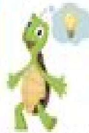
Step 4: Come out when you feel calm and free of a bad day

For more information, please visit our website at www.ncfm.ca or call us at 1-800-387-3873.