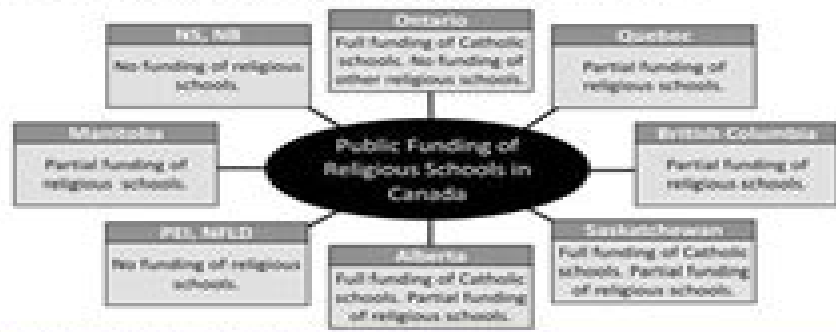
Figure 1: Status of Faith-Based Funding Across Canada

When it comes to education policy, why is a revision of Catholic school public funding necessary in Saskatchewan? Three policy alternatives are presented to contest this problem, concluding with our policy recommendation.