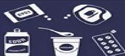
Table-top sweetener, low-calorie beverages, prepared food, and pharmaceutical products.