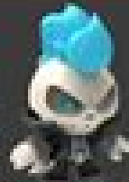
02 BLUE GHOST RIDER