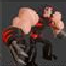
03 WEAPON 9 ANGLAUSPICE