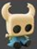
07 HOLLOW KNIGHT