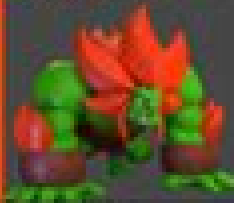
01 BLAND A