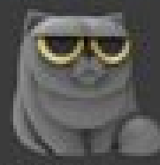
04 GRUMPY CAT