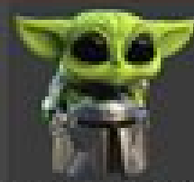
06 BABY YODA / GROGU