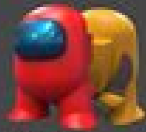
01 AMONG US