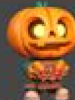
05 C. CARRASCO