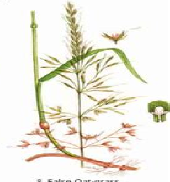
8. False Oat-grass Arrhenatherum elatius