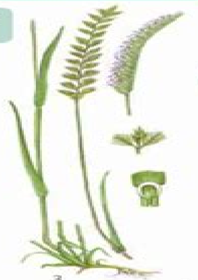
3. Crested Dog's-tail Cynosurus cristatus ●