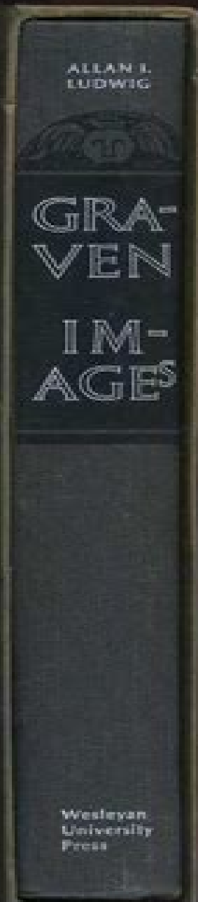
Graben Images - Book spine & front panel