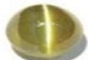
Chrysoberyl cats eye