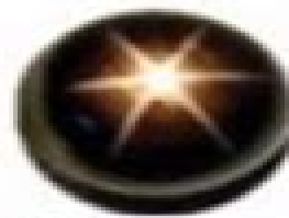
Golden star sapphire