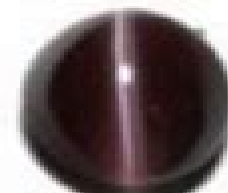
Sillimanite cats eye