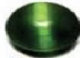
Kornerupine cats eye