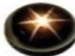
Golden star sapphire