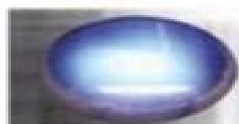
Blue moon stone