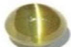
Chrysoberyl cats eye