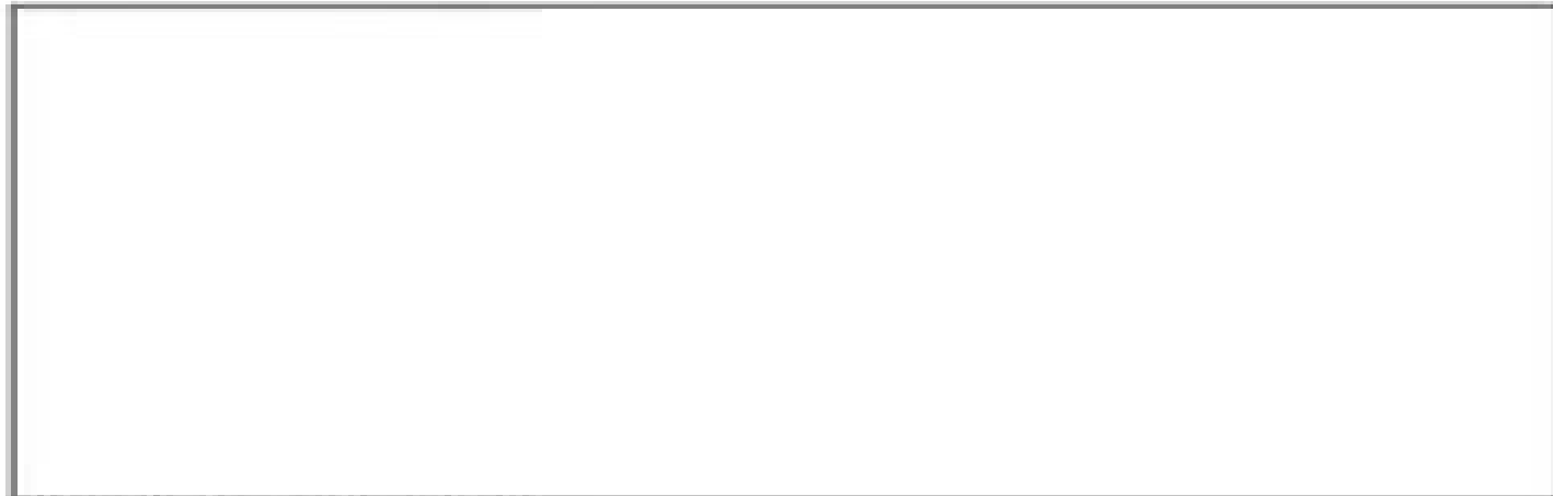
(Cleveland Health Line BRT station)

The BRT routes will feature longer vehicles with multiple entrances and exits to let large numbers of riders quickly move between the station platforms and the BRT vehicles.