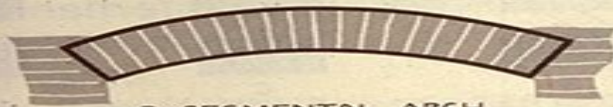
B - SEGMENTAL ARCH