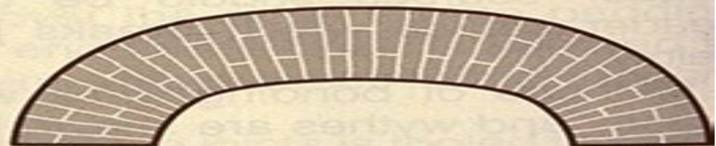
G - THREE CENTERED ARCH