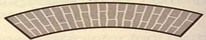
C - BONDED ARCH