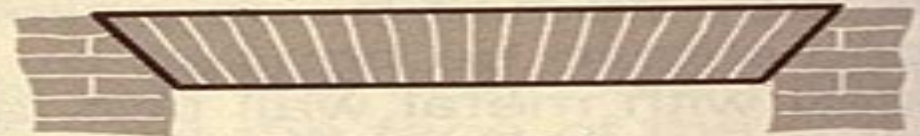
F - FLAT ARCH