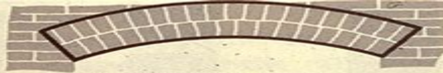
A - ROW-LOCK ARCH