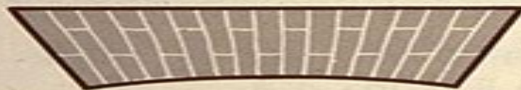
E - FLAT ARCH