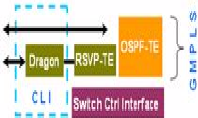
Basic modules in GMPLS controller