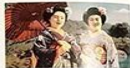
Since white skin was considered beautiful, women and girls painted their skin white and protected themselves from the sun with parasols.