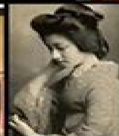
A woman waits for her pale night back, and her pale night back is her pale night back.