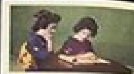
In the late 19th century, when the Japanese were still painted their skin white and protected themselves from the sun with parasols.