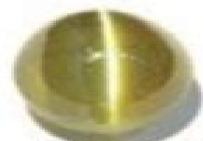
Chrysoberyl cat's eye