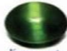
Kornerupine cat's eye