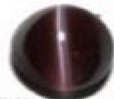
Sillimanite cat's eye