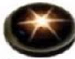
Golden star sapphire