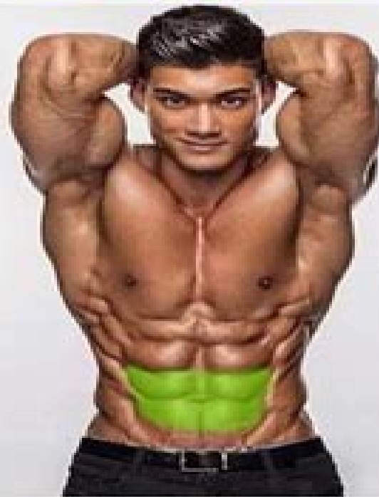
Hanging Leg Raises