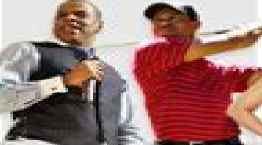
Jay-Z Born 1969