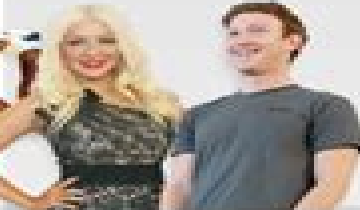
Christina Aguilera Born 1980