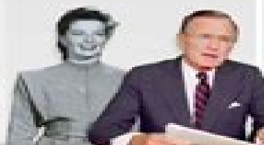
Katharine Hepburn Born 1907