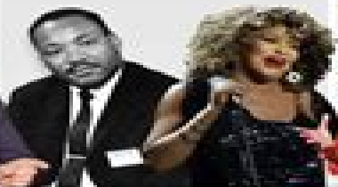
Martin Luther King, Jr. Born 1929