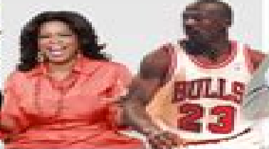
Oprah Winfrey Born 1954