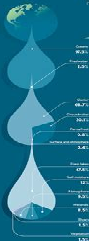
DISTRIBUTION OF THE EARTH'S WATER