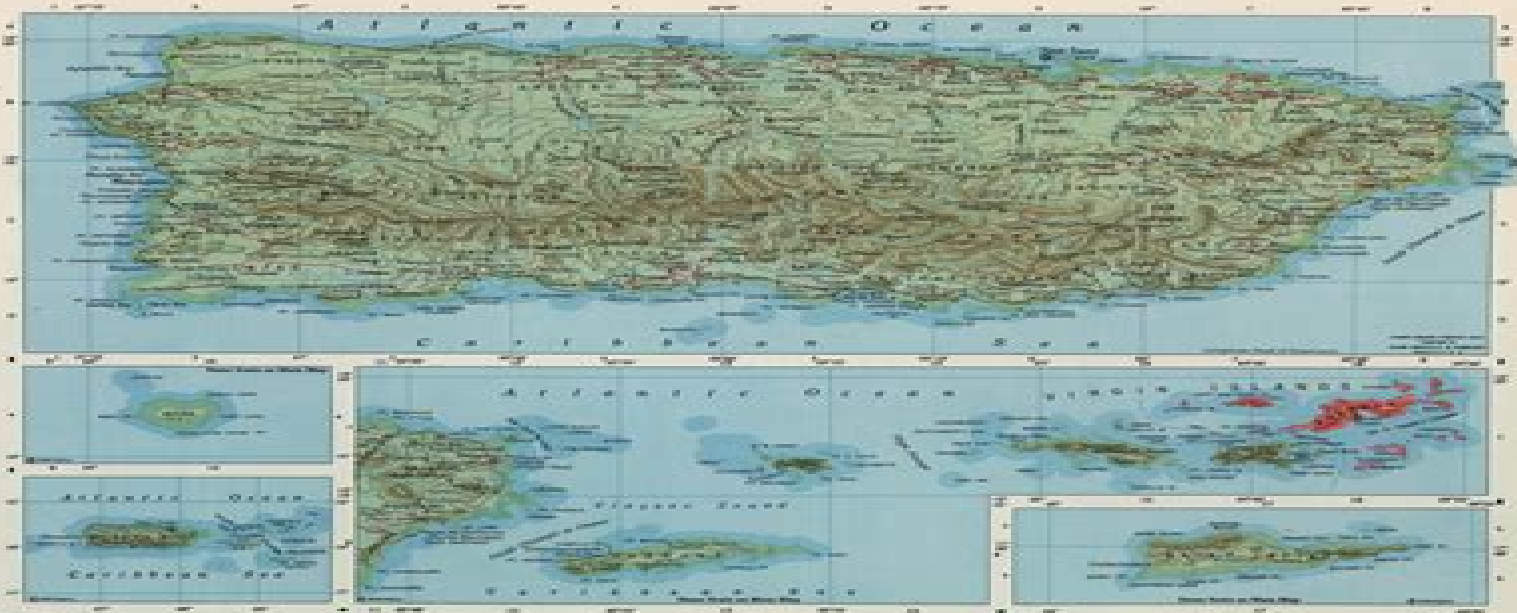
Map of the Caribbean region showing the Atlantic Ocean, the Caribbean Sea, and the surrounding landmasses.