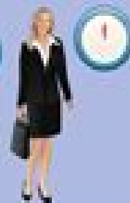
Coming in time