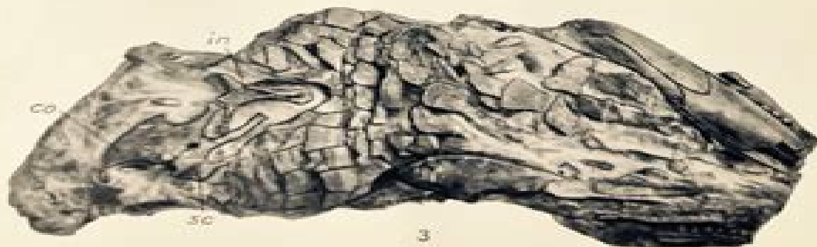
Plesiosauroidea alberti Gilmore and Plesiosauroidea granulosa Cox