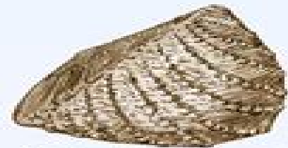
Myophorella luddlowensis (Lycett)