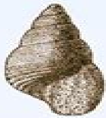
Bourguetia xanmanai (Opel)