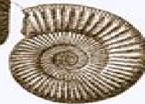
Periplanetes pickeringii (Young & Bird)