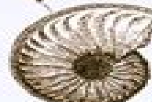
Ammonoceras serratum (J. Sowerby)