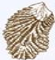
Lepus gregaria (J. Sowerby)