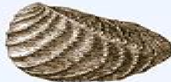
Myophorella clavellata (J. Sowerby)