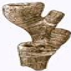
Thecamella amularis (Flemming)