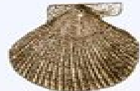
Chlamys splendens (Dollfus)