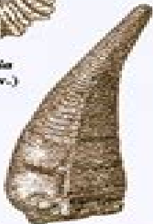
Perna lanceolata J. Sowerby