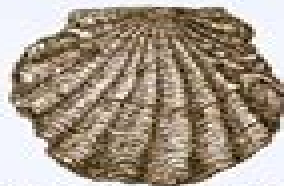
Ctenostrea proboscideum (J. Sowerby)