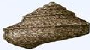
Bathrotentaria reticula (J. Sowerby)