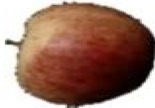
Apple Red 3