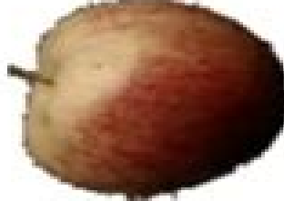
Apple Red 3