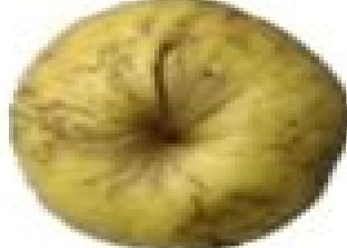
Apple Golden 1