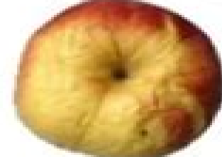
Apple Red Yellow 1