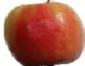
Apple Pink Lady