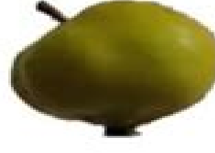
Apple Red Yellow 2