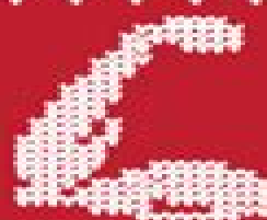
Feats of Strength