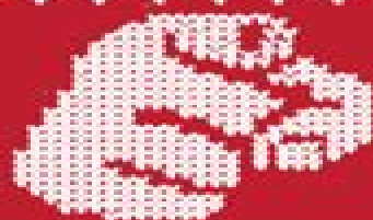
Airing of the Grievances