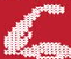
Feats of Strength