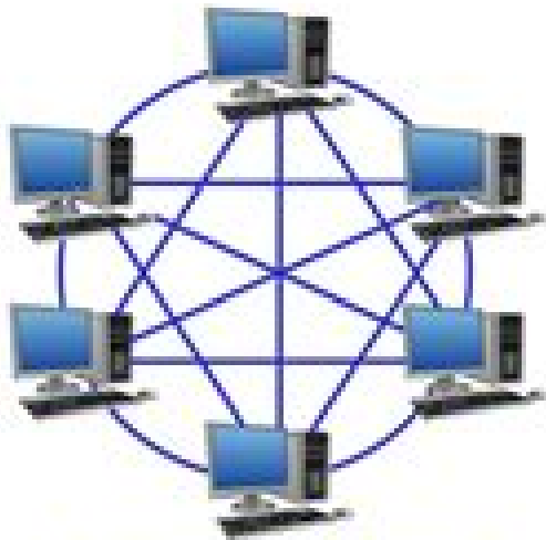
Fully Connected Network Topology