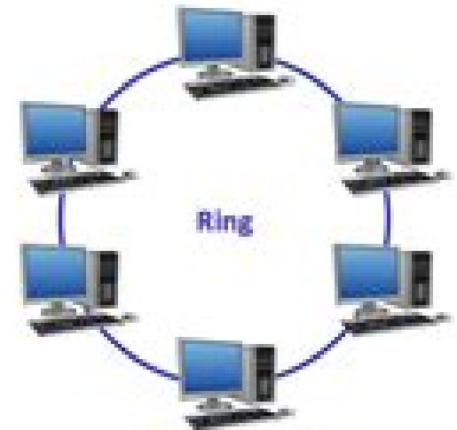
Ring Network Topology