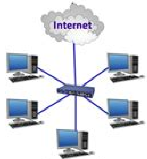
Star Network Topology