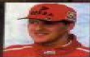
Michael Schumacher FERRARI