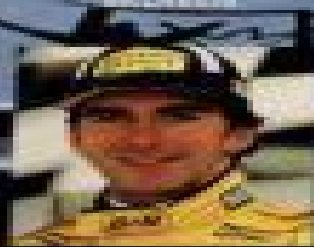
Damon Hill JORDAN