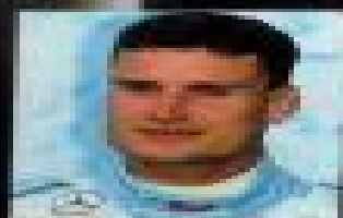
David Coulthard McLAREN