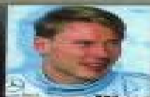
Mika Häkkinen McLAREN