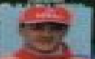
Mika Häkkinen McLaren