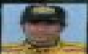
Eddie Irvine Jaguar