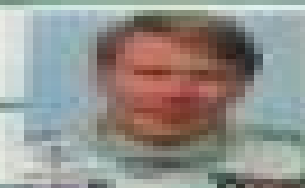
Michael Schumacher Ferrari