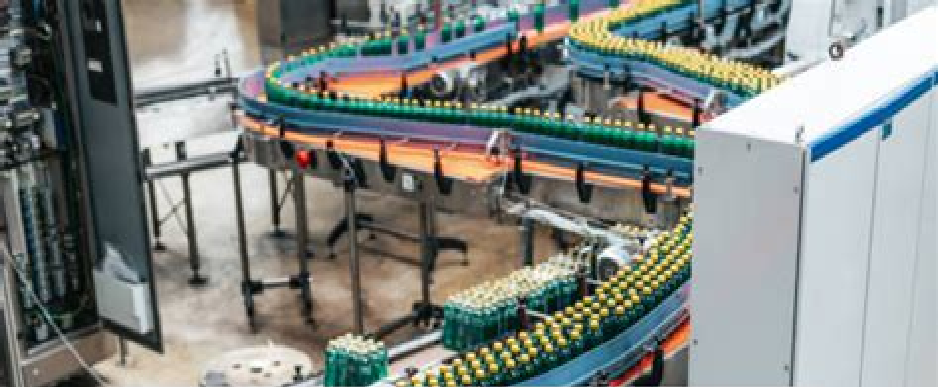
Fruit & Vegetable Processing Machines