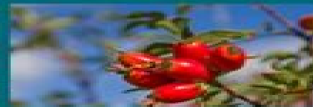
ROSE HIP BERRIES