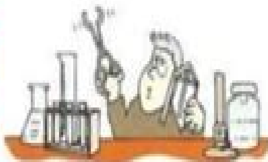
Applying Theory A