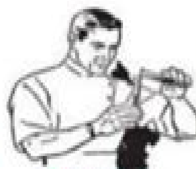
Applying Theory B