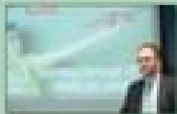
YEC of the World member speaking at a podium.

YECs of the World is a community of entrepreneurs who are passionate about their work and committed to helping others succeed. The network is a global community of entrepreneurs who are passionate about their work and committed to helping others succeed.