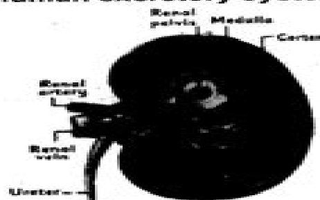
Internal structure of kidney