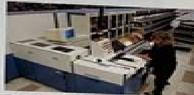
The United States Postal Service uses computers to sort mail in most of its offices.