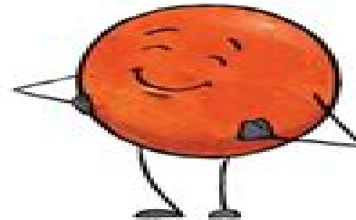
Having a Positive Attitude