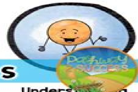
Understanding Personal Space