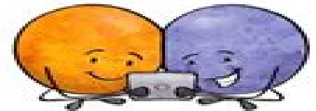
Working with Others