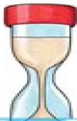
Waiting & Having Patience