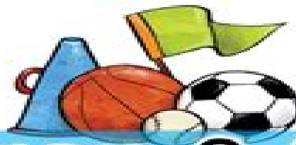
Being a Good Sport