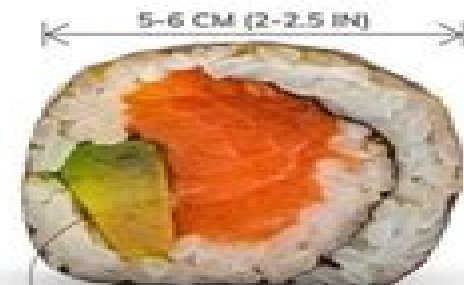
4 OR MORE FILLINGS