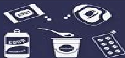
Table-top sweetener, low-calorie beverages, prepared food, and pharmaceutical products.