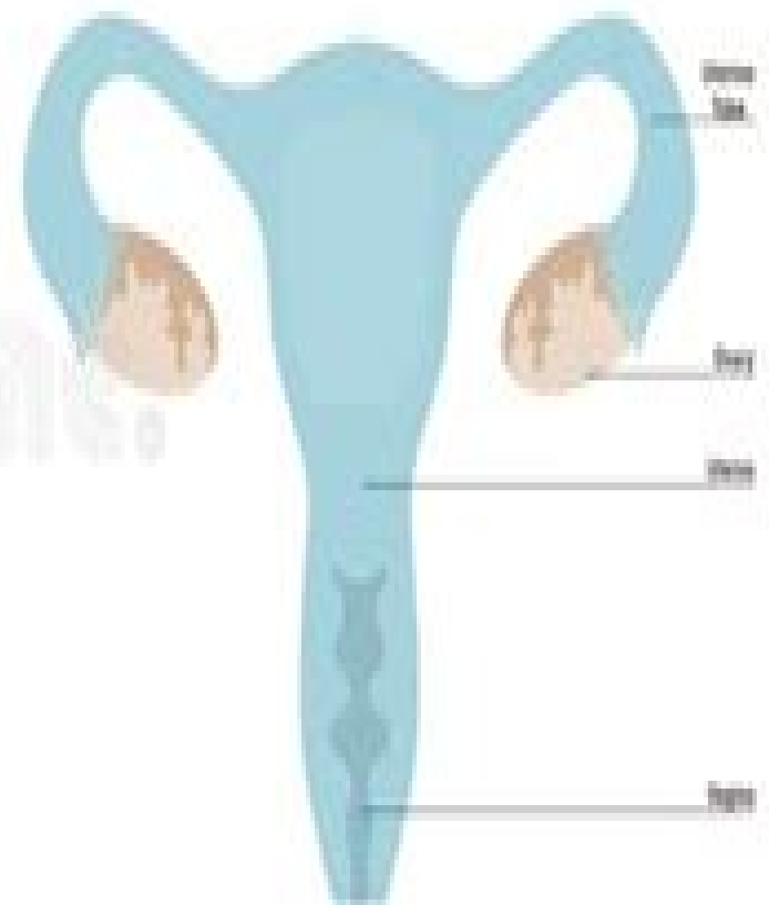
Female Reproductive System