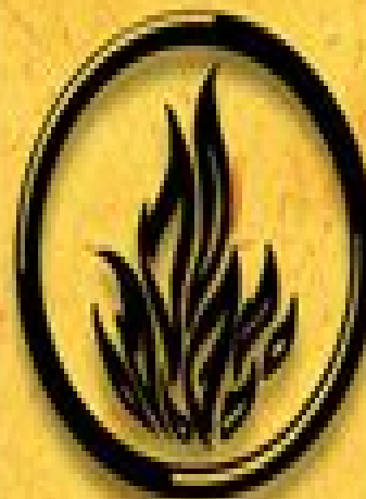
DAUNTLESS (The Brave)