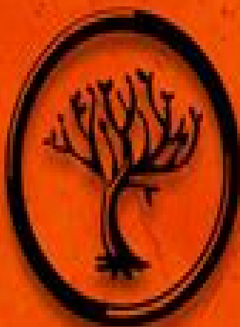
AMITY (The Peaceful)