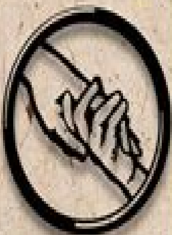
ABNEGATION (The Selfless)