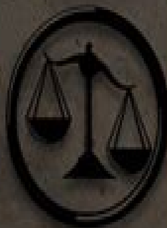
CANDOR (The Honest)