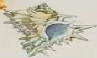
Giant Eastern Murex