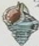
Atlantic Heavy Triton